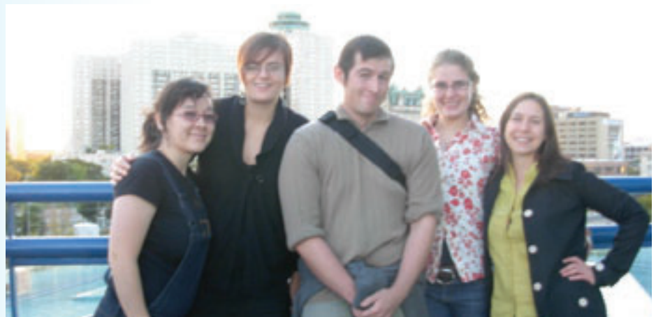
CYL interns: “The term ‘northern’ refers to a way of looking at the world and a general attitude.”